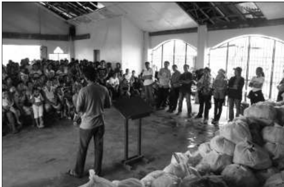
Aid distribution in the Philippines following the earthquakes and cyclone last year. Friends from around the world donated almost $US60,000.

Dulag in Tacloban was among the worst hit area when the super typhoon hit Leyte province. We used 3 vehicles to transport all the goods to be distributed to Leyte.