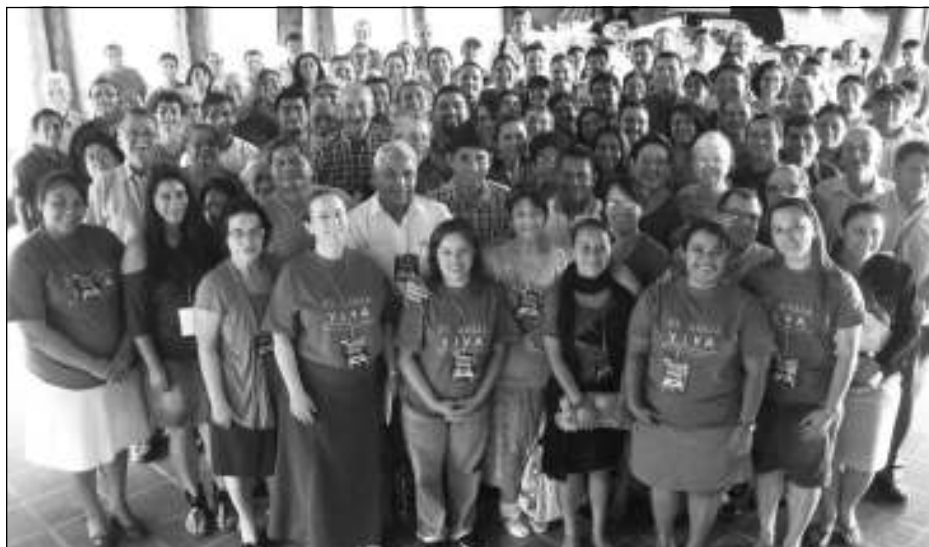
Friends attending the FWCC Section of the Americas Consultation in El Salvador.

Both North American consultations in California and North Carolina featured the same workshop topics, with different leaders. The workshops on Conflict Transformation were led by members of the New York Yearly Meeting Committee on Conflict Transformation. Given that many Monthly Meetings are troubled by tensions among members, these workshops explored commonly-arising incidents and shared insights into how they can be acknowledged; how they can be addressed; and how the Meeting can use conflict as an opportunity for advancement and transformation.