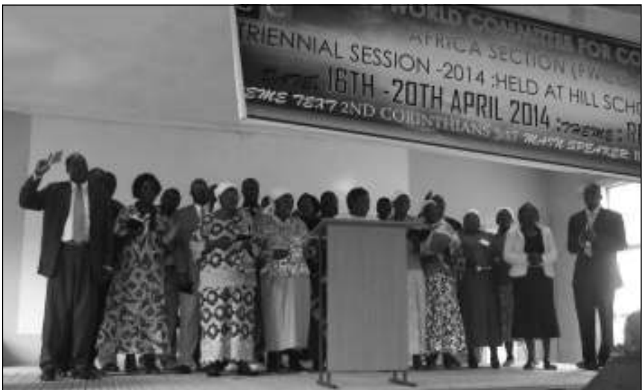
Friends singing at the Africa Section Triennial.

It is worth mentioning that the fact that the conference was falling on Easter time raised fears initially to the planners because we wondered who will be ready to sacrifice